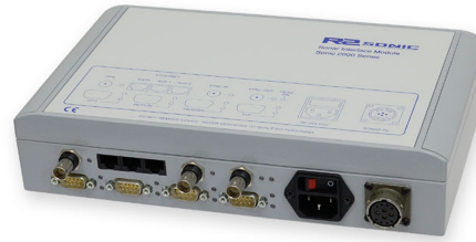
Sonar Interface Module