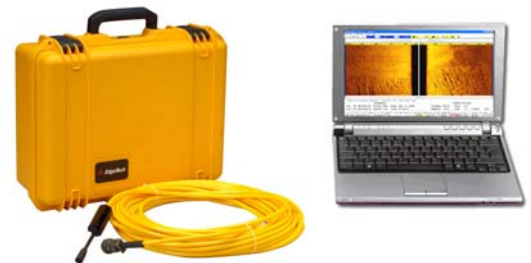
EdgeTech Model 4100-P Portable Topside Processor

The long-lasting affordable workhorse of hydrographic surveying.