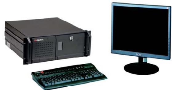
Model 4100 Rack Mount Topside Processor

GEOMETRA INTERNATIONAL (PRIVATE) LIMITED LAND AND HYDROGRAPHIC SURVEYS