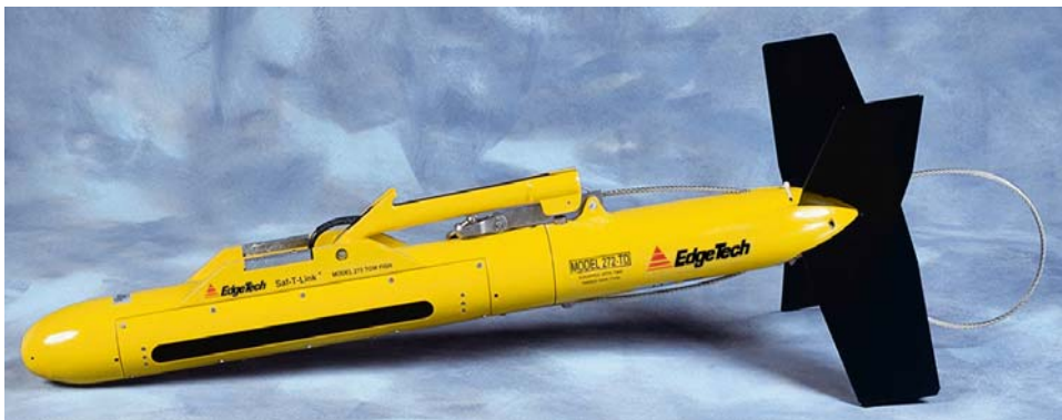
EdgeTech 272-TD Towfish

The EdgeTech 4100 Side Scan Sonar System is the long-lasting affordable workhorse of hydrographic surveying. The system comes standard with either a 19 inch rack mount or portable topside processor running EdgeTech's DISCOVER acquisition software along with a dual frequency 100/500 kHz towfish (model 272-TD).